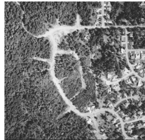
1986 Aerial view of Barrett Drive.

Home construction proceeded rapidly in the 1980's, and during the next decade. The remainder of Barrett Drive, Sentinel Place, Kingcome Crescent, Echo Park East and West, and other streets would be finalized. This giant development project implemented over 20 years consisted of 31 plans of subdivision resulting in 784 building lots (2 of which contain the water towers).