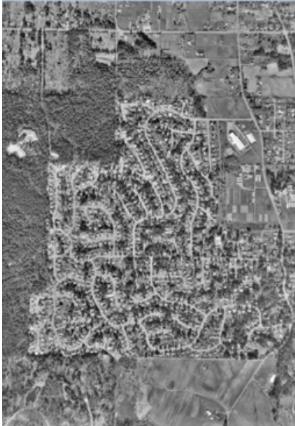
Aerial View, 1995: Dean Park Estates.

By the early 1990s, the development of Dean Park Estates was almost complete and only a few empty building lots remained. In 1992, the developer, Park Pacific Apartments Ltd. gave stewardship of the subdivision to the newly formed Dean Park Estates Community Association to administer the Building Scheme (Schedule of Restrictions) that is attached to each property title. For 20 years the volunteers of the Association, supported by municipal staff and council members, endeavored to maintain the standards established for the subdivision. When new houses were built on vacant lots, or when changes were made to the exteriors of existing houses, the Association volunteers checked the plans for conformance